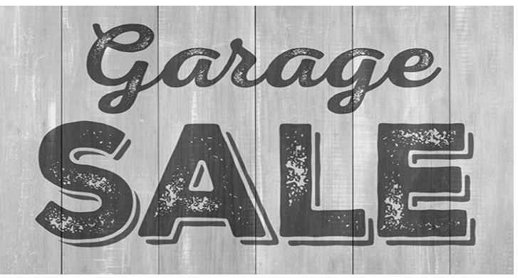
Ladies Auxiliary Garage Sale Coming Soon at the end of September!!!

Ladies Auxiliary Coffee Sunday/Bake Sale: On Sunday, September 12 after the 9:00 and 10:30 a.m. masses. More details to follow in the coming weeks.